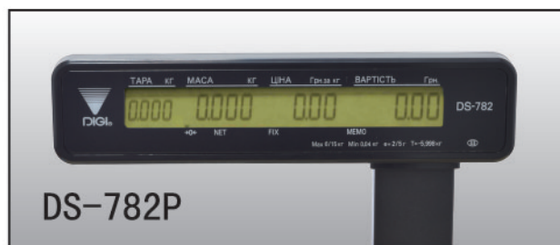
Customer side display

99 PLU can be programmed with unit price and tare weight